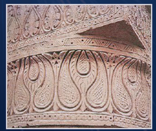
Buta motif on the entrance of a Persian sanctum