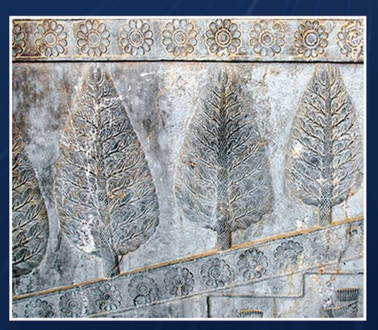
Cedar tree in the cravings of the Persepolis