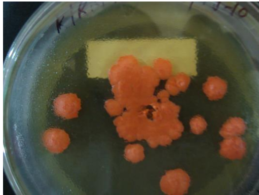
Figure S1: Isolate rsk4