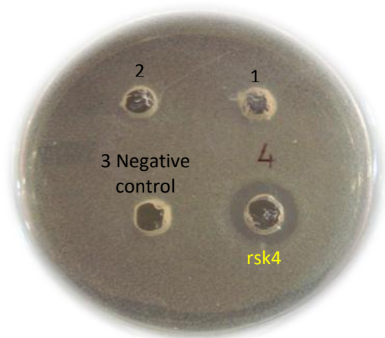
Figure S3: Antibacterial assay of rsk by agar well diffusion method